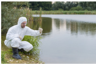
Pollution & Environment