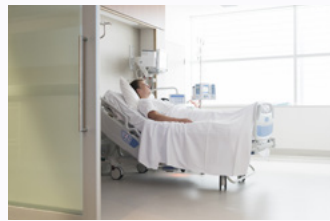
Biomedical & Health