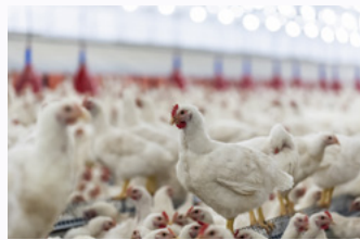
Food / Pharma / Veterinary / Industry