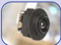
CamSight LP (HS)