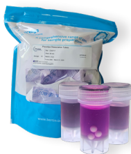
D30717 Dissociation Tube