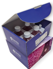
D05717 Multi Tissue Dissociation Kit