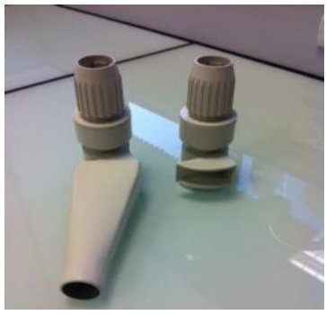
Left : Air intake with 25mm connection Right : Standard air intake